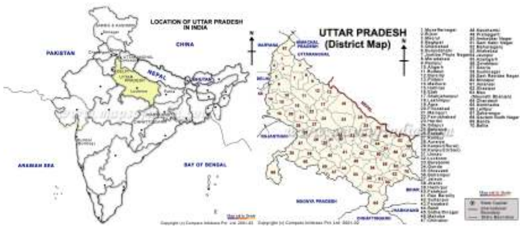
Uttar Pradesh State (marked in yellow) within India, Gonda District (No: 34) within UP

The location map of the project is furnished below: