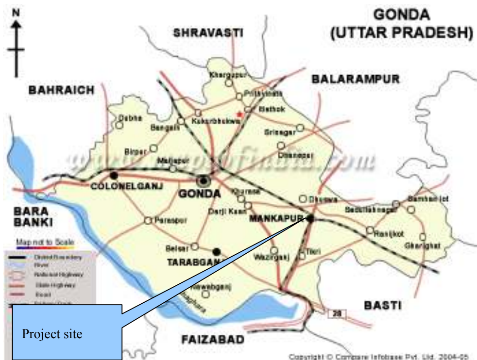
Location of the project site in Mankapur village of Gonda District