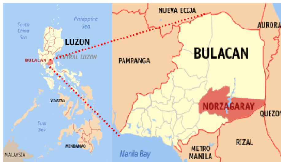
Figure 3 Location Maps 2

Norzagaray is a first class municipality located south east in the province of Bulacan. It has a population of 76,978 people in 15,912 households subdivided into 13 barangays.