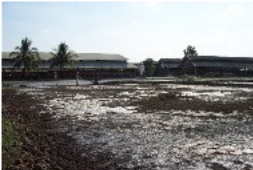
Figure 1 Lagoon, The Local Common Practice

PhilBIO proposes a novel animal waste management system to recover methane gas emissions as an alternative to current open lagoon systems. Wastewater treated in these lagoons is often at an ambient temperature of around 35°C, and under anaerobic conditions. The result of this is that biogas (mostly methane) is emitted continuously to the atmosphere, as can be seen in this typical farm lagoon system image.