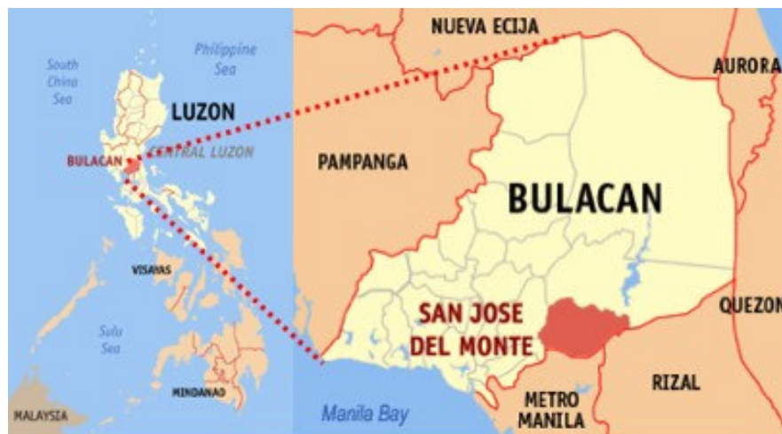
Figure 3 Location Maps 2

San Jose del Monte City (or simply San Jose) is a second class/partially urban component city in the province of Bulacan. It is bordered by Caloocan city and Quezon city, both in Metro Manila, in the south; by Rodriguez, Rizal in the east; Sta. maria and Marilao, both of Bulacan, in the west and Norzagaray, Bulacan in the north. It has a population of 315,807 people in 66,179 households. Major agricultural crops are leafy vegetables, root crops (ube and cassava) pineapple, mango and coffee beans. There are a total of 60 commercial livestock and poultry farms in the city. Major industries are iron and marble works, furniture, handicrafts, food processing, housing, etc. San Jose del Monte City is divided into two districts for representation purposes. It is politically subdivided into 59 barangays of which 23 comprise the first district while the rest comprise the second district.