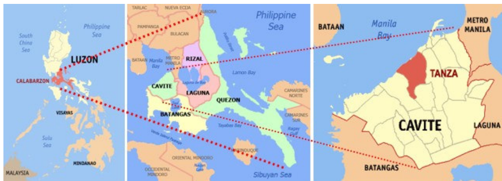
Figure 3 Location Maps 2

is agricultural area. Agricultural crops include food crops (rice, corn, leafy and fruit vegetables and rootcrops); and industrial and commercial crops (coffee, banana, coconut, pineapple, mango, papaya and fruit-bearing trees); and ornamental crops (orchids, African daisy and anthurium). Crop production is complemented by livestock and poultry production, which involve both backyard and commercial levels of production. Tanza (formerly known as Sta. Cruz de Malabon) is a 1st class municipality in the province of Cavite. It has a population of 110,517 people in 23,059 households, which are divided by 41 barangays with a total land area of 98.2 square kilometres.