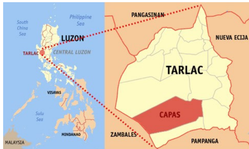
Figure 3 Location Maps 2

Capas is a 1 st class municipality in the province of Tarlac, Region III- Central Luzon. The Municipality has a population of 95,219 people divided into 20 barangays on a total of 18,333 households (as of year 2000).