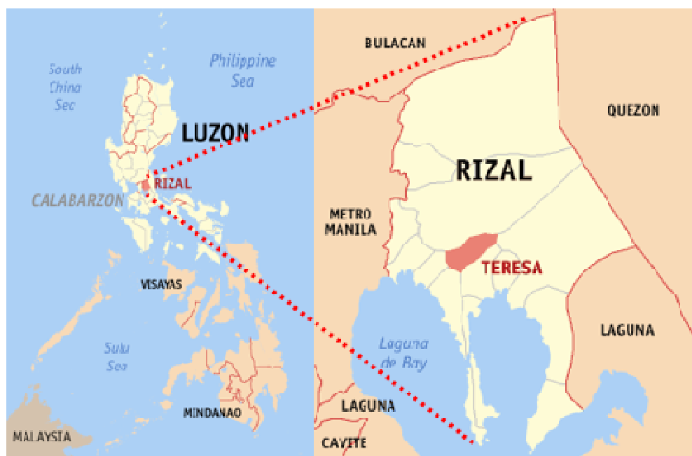
Figure 3 Location Maps 2