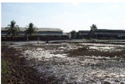
Figure 1 Lagoon, The Local Common Practice

HBC proposes an alternative manure waste management system to recover methane gas emissions as an alternative to the current open lagoon systems. Wastewater treated in these lagoons is often at an ambient temperature of around 35°C, and under anaerobic conditions. The result of this is that biogas methane is emitted continuously from lagoons as can be seen in this typical farm lagoon system image.