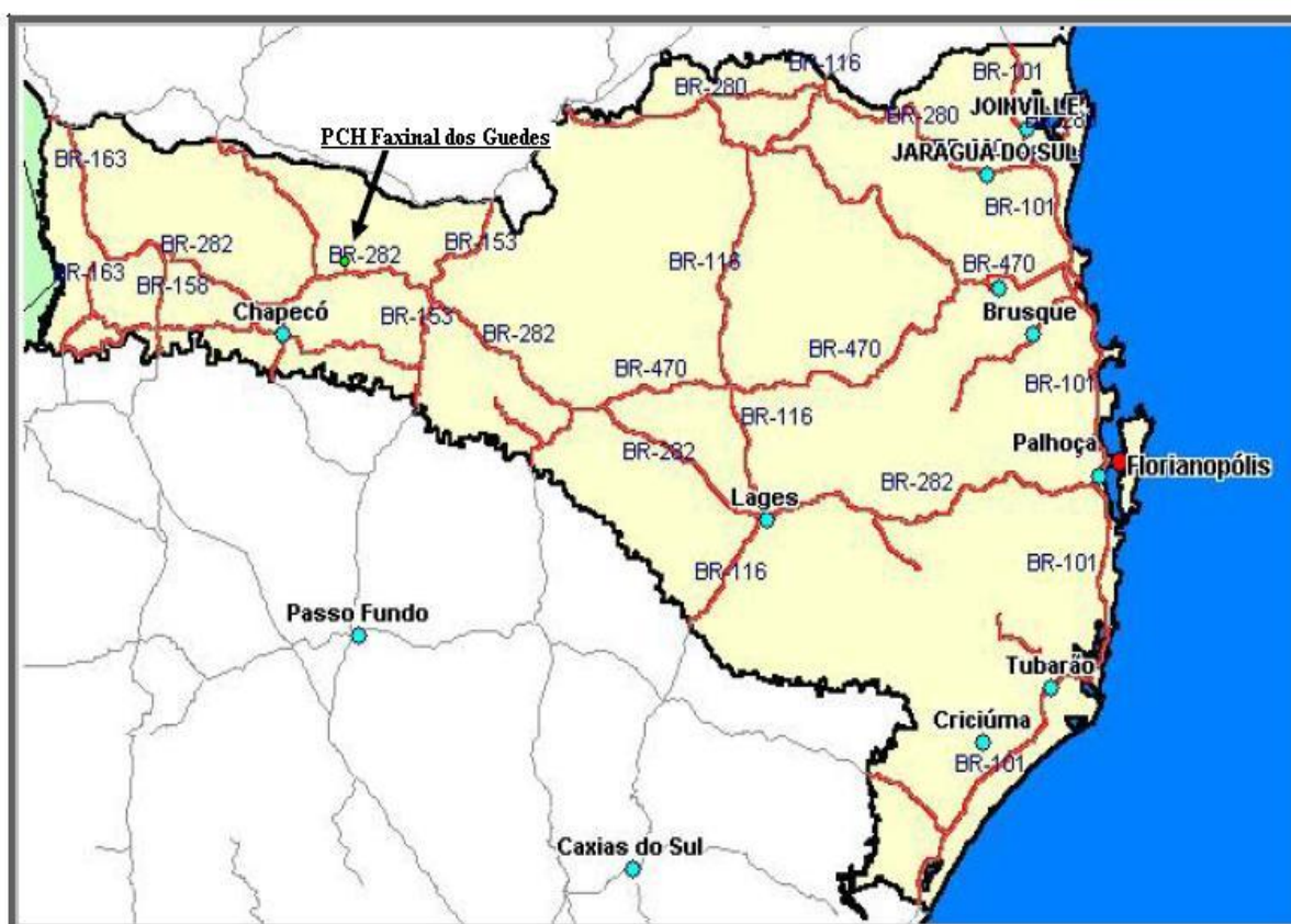
Figure 1: Map of Santa Catarina State showing the project location

The FAXSHP is located in the kilometer 81 of Chapecozinho river, in the Municipalities of Faxinal dos Guedes and Ouro Verde, Santa Catarina State, Brazil (Figure 1). The coordinates are 26° 26' South, 52° 14' West.