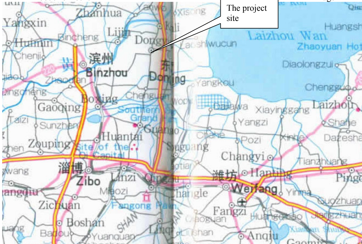
Figure 2 The location of the proposed project in Shandong Province