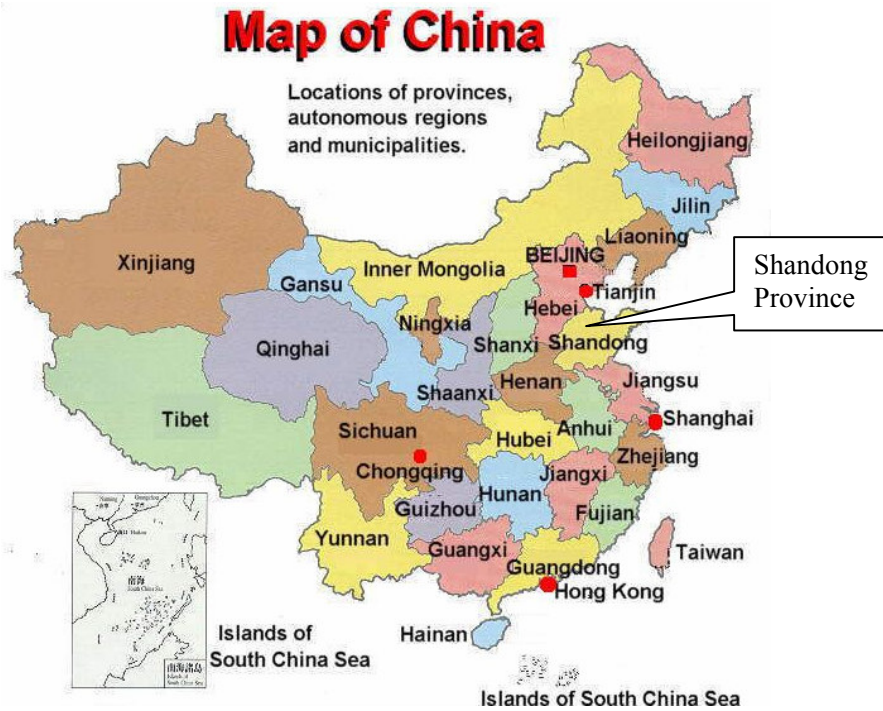
Figure 1 The location of Shandong province in China

The proposed project is located in Hekou District, Dongying City, which is located in north of Shandong Province, east and north to Bohai, west to Binzhou City, South to Zibo City and Weifang City. The geographical coordinates of the proposed project is east longitude 118°15'-118°22' and north latitude 38°04'-38°07'.